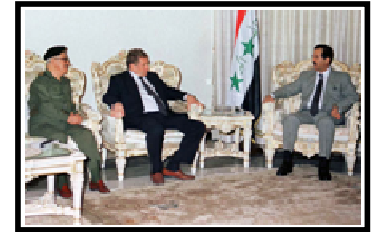
Zhirinovskiy with Saddam Hussein and Tariq Aziz (3 rd November 1998)

Roberto Fiore is a close friend of Nick Griffin and has known him for over thirty years. He is a convicted terrorist and leader of the neo-fascist Forza Nuova. He has close links to Front National, Jobbik and to Russia’s fascist movement.