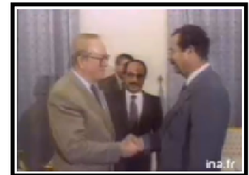
Le Pen with Saddam Hussein in Baghdad (November 1990)

Griffin said each of the parties involved with the formation of the new party will submit a representative to a presidency body that will coordinate decisions. The presidency will then elect a chief. According to the European Parliament's official journal, this has led to speculation over a role for Griffin. 9