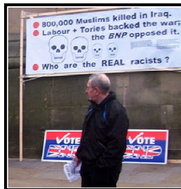
Newcastle BNP activist (December 2009)