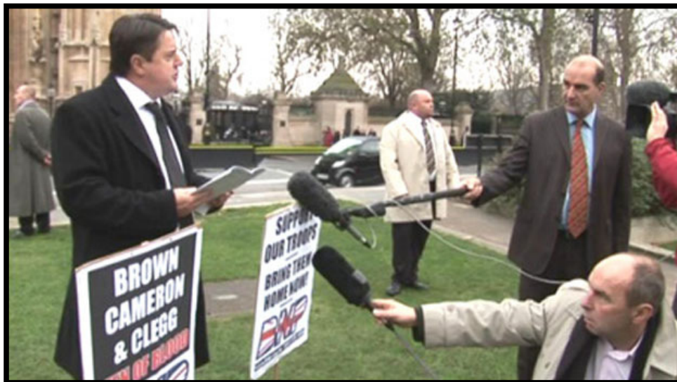
Nick Griffin outside Westminster calling for troops to retreat from Afghanistan (December 2009)

"Don't give money to enemies of Europe. Boycott USA!"