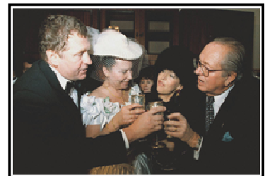
Jean Marie Le Pen at Zhirinovskiy's wedding anniversary (February 1996)