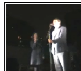
Fiore speaking in Budapest at a Jobbik rally (October 2008)