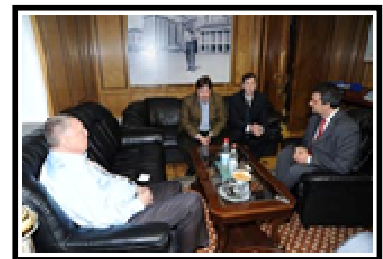
Zhirinovskiy, seated far-left, with Fiore, seated far-right (November 2009)